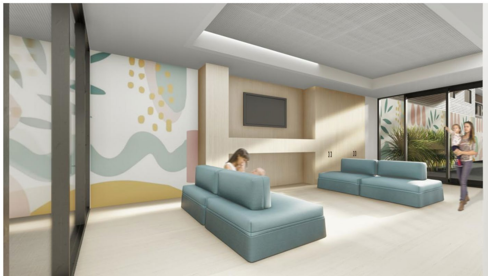
An artist's impression of the Belmont Private Hospital's peri-natal unit.

The project is part of an $80m pipeline of new developments and redevelopments. Healthe Care's Specialty Services business is undertaking nationally, in-line with increasing demand for mental health services Australia-wide.